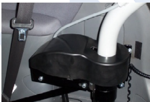
Optional swivel unit

ELAP Engineering Ltd Fort Street, Accrington, Lancashire BB5 1QG Tel: 01254 871599 Fax: 01254 389992 E-mail: mail@elap.co.uk www.elap.co.uk